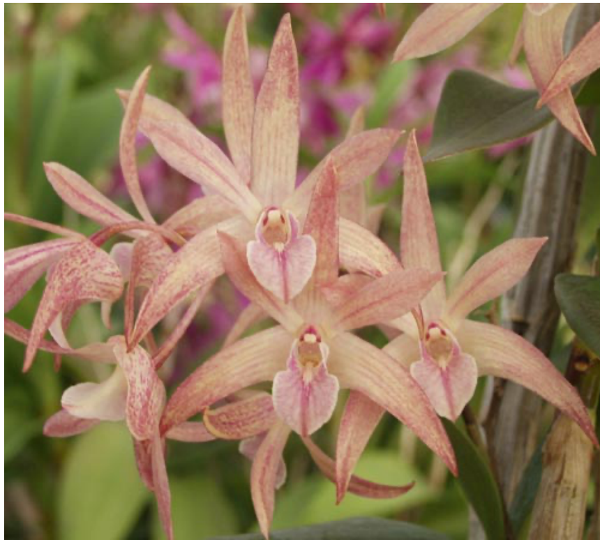
Photo of Den. Peewee x Den. Karen Nair "SVO" from Sunset Valley Orchids

Please Bring Plants for a Member Plant Sale!