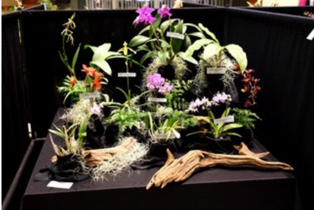
Greater Cincinnati Orchid Society Display