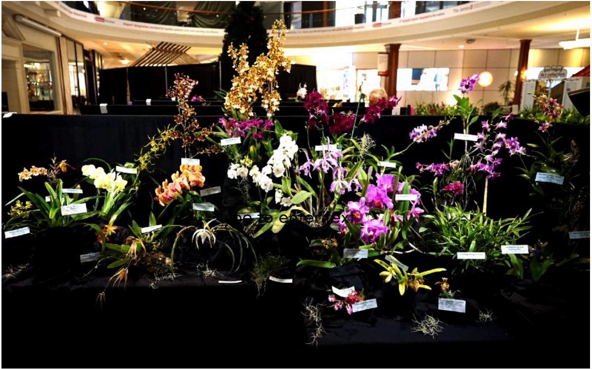
Kentucky Orchid Society Display