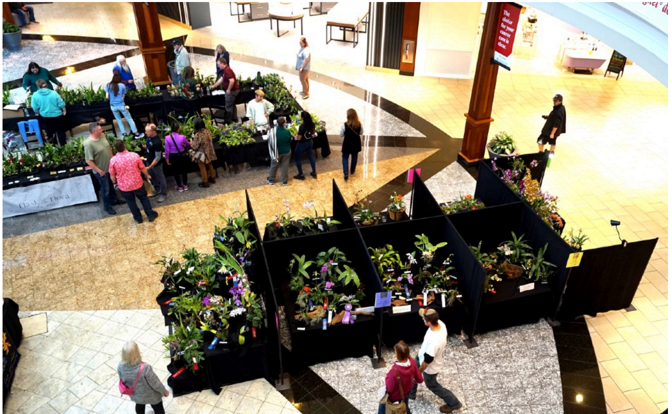
The 2024 Central Ohio Orchid Society Show from above