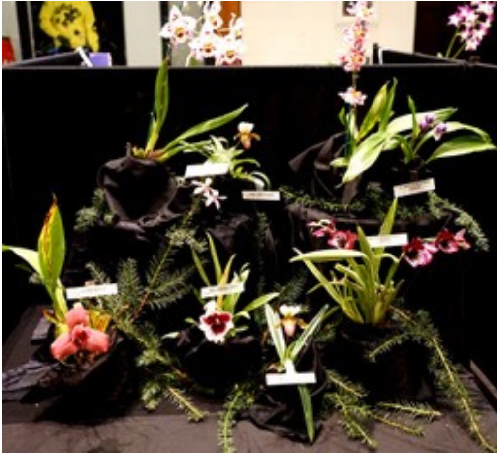
Flask and Flora Display