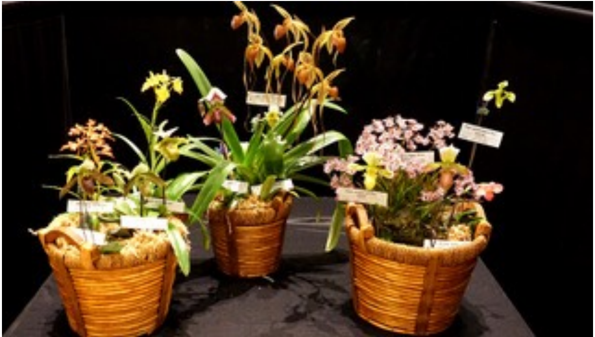
Little Frog Farm Display