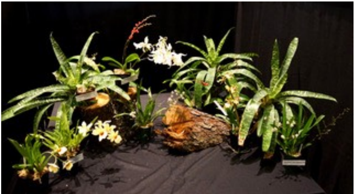
BarTrop Plant Display