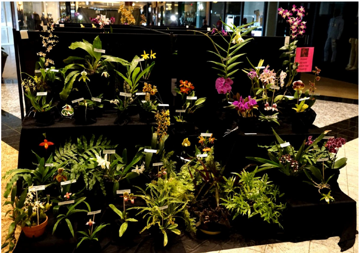
The Central Ohio Orchid Show 2024 Display