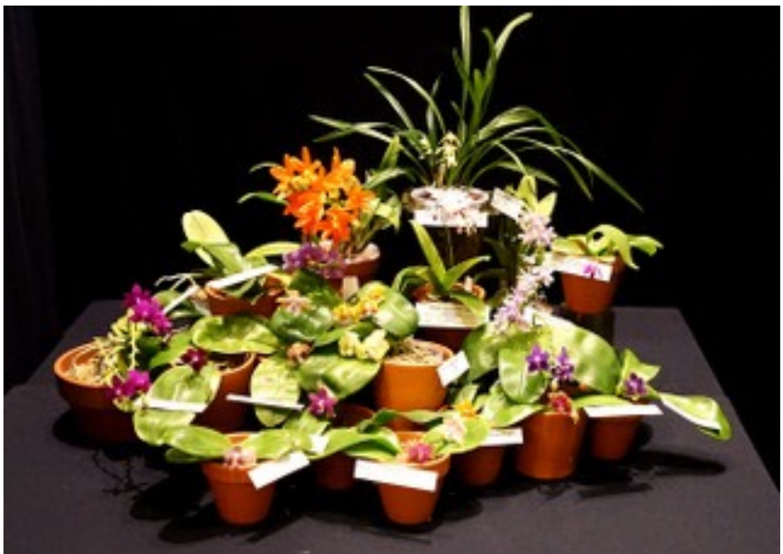
HC Orchids Display