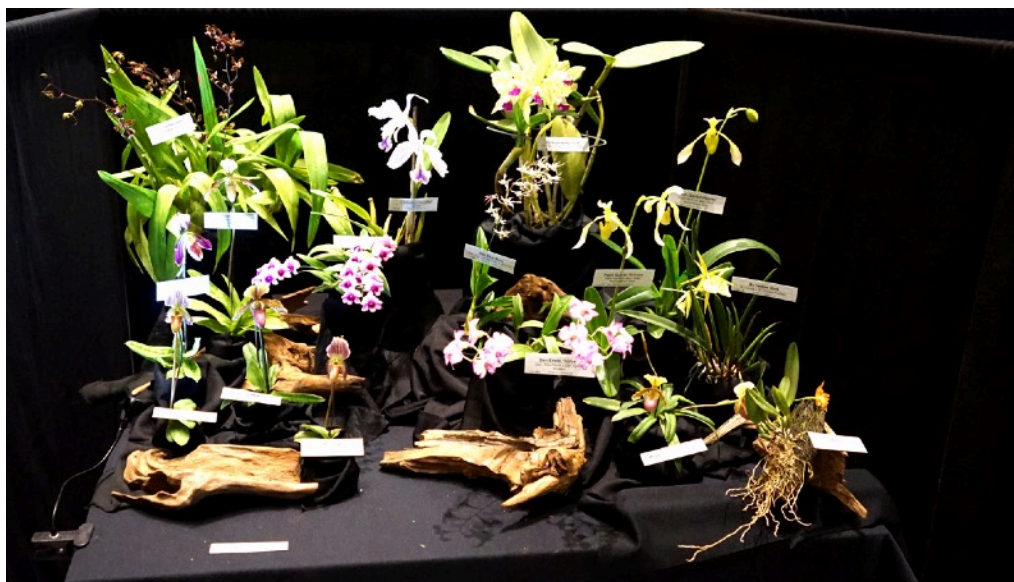
Miami Valley Orchid Society Display